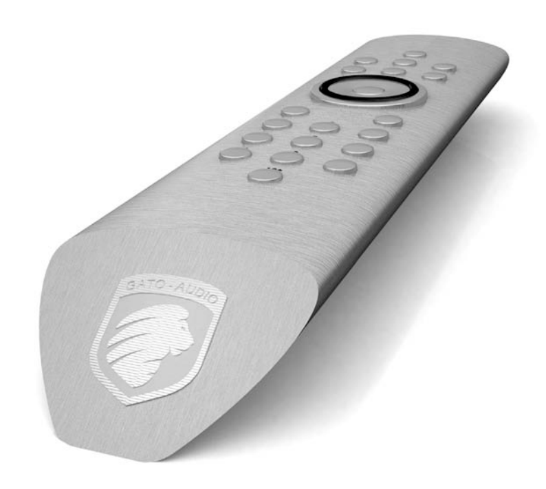
RC-1 Remote Control User Manual